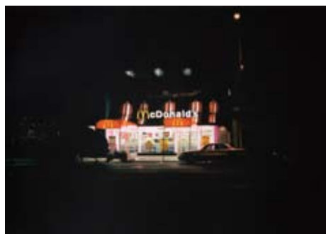
5 M / New York, 2002 / 2010