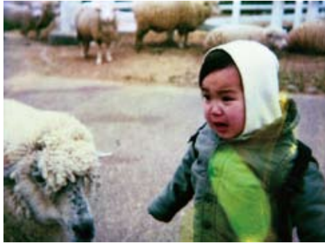
12 series of Tokyo and My Daughter , 2010