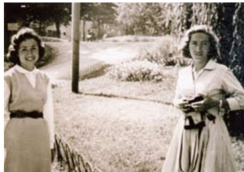
10 series of Widows, 2009

In summer 2009, Homma visited Rapallo in Italy, a city with approximately 30,000 inhabitants located about 30km east of Genova, and photographed 11 widows living in Rapallo or Genova. This series was planned as he was invited to the 4th Contemporary Photography Festival in Rapallo in 2010. He photographed not only the widows' portraits but also the inside of their houses and surroundings. What is more, he reproduced old snapshots that had been tucked away in their chest drawers and albums, and mixing them together, he compiled a photo book of the series.