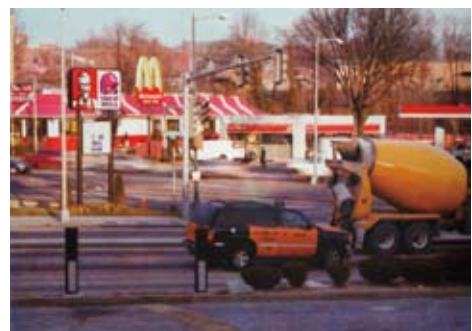
6 M / Washington D.C., 2009 / 2010

Homma’s new series are silk-screen prints based on the photographs of the fast food chain which he continues taking. McDonald’s are extending the number of shops globally with the famous logo, and that multiplying aspect corresponds to the silk-screen method.