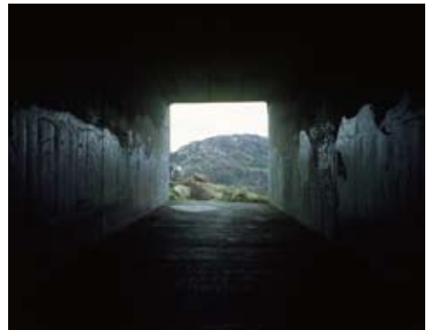
4 series of Together, 2006