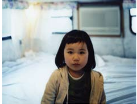
13 series of Tokyo and My Daughter , 2006

A girl's portraits and Tokyo scenery are incorporated by turns in most parts. The girl's photos describing each stage of her growth; baby, kindergarten, elementary school and so on, look like a selection from family albums. You may guess that this series is the artist's record following after his daughter's growth as the title "My Daughter" suggests, but it is not the fact. It will lead you to give further consideration to images and contexts that you see in the photographs, and to think about what photography is.