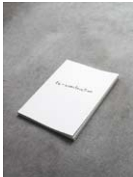
8 re-construction, 2011