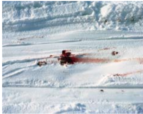
1 series of Trails, 2010