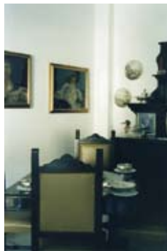
10 series of Widows, 2009