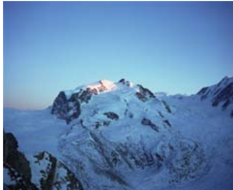
7 Monte Rosa, 2006

Mountains: Seeing Itself introduced in 2008 was reproduced for this exhibition. Looking into the darkroom through binoculars, you will find 12 light boxes. When brought into focus, mountains including Matterhorn, Eiger, Jungfrau, Monte Rosa, and others appear respectively.