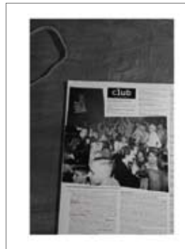
9 re-construction, 2011