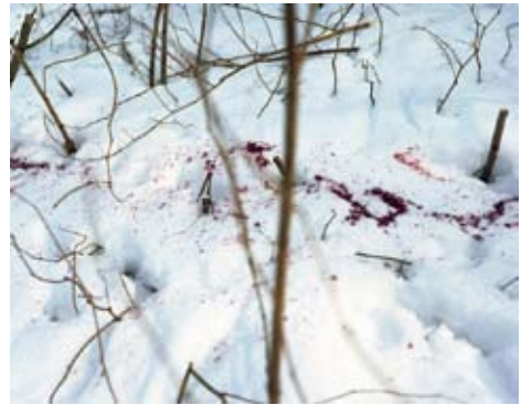
2 series of Trails, 2010

Red marks left on white snow. These blood-like stains can be regarded as proof of some creature caught in the hunt. It tells us nothing else, and we find ourselves trifled with ambiguity of reality as we observe only absence of life in the photograph. Displayed are reproduced prints of the series introduced in 2009 and a painting of the same title.