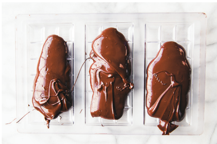
From Dandelion Chocolate (published by Shinsensha)