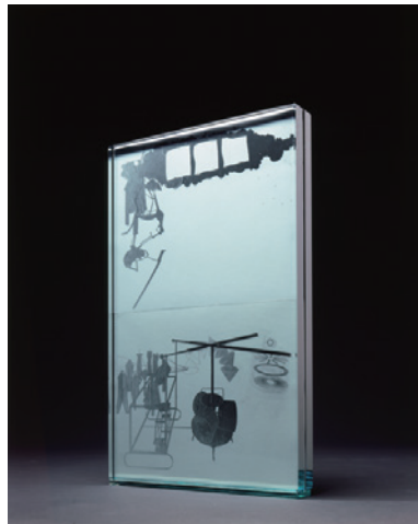
Hiroshi Sugimoto, Wood box , 2004 glass, wood Collection of the artist ©Hiroshi Sugimoto / Courtesy of Gallery Koyanagi