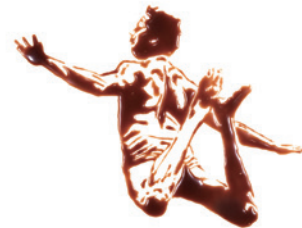
Vik Muniz, Picture of Chocolate: Diver (After Siskind) , 1997 chibacrome print H150×W119.8cm Collection of 21st Century Museum of Contemporary Art, Kanazawa ©Vik Muniz / VAGA, New York & JASPAR, Tokyo, 2018