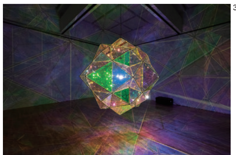
Olafur ELIASSON, The exploration of the center of the sun , 2017, collection of the 21st Century Museum of Contemporary Art, Kanazawa ©Olafur Eliasson

Installation view at Olafur Eliasson: Sometimes the river is the bridge (Museum of Contemporary Art Tokyo, 2020) Photo by Kazuo Fukunaga