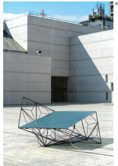
Olafur ELIASSON, The exploration of the center of the sun , 2017, collection of the 21st Century Museum of Contemporary Art, Kanazawa ©Olafur Eliasson

Installation view at Olafur Eliasson: Sometimes the river is the bridge (Museum of Contemporary Art Tokyo, 2020)