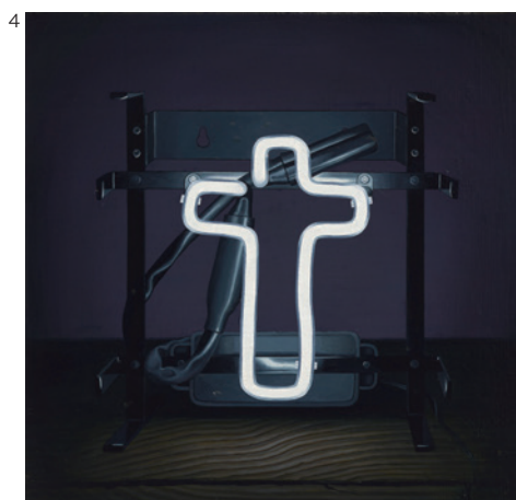
Cross 2018 oil on linen 46 × 46 cm