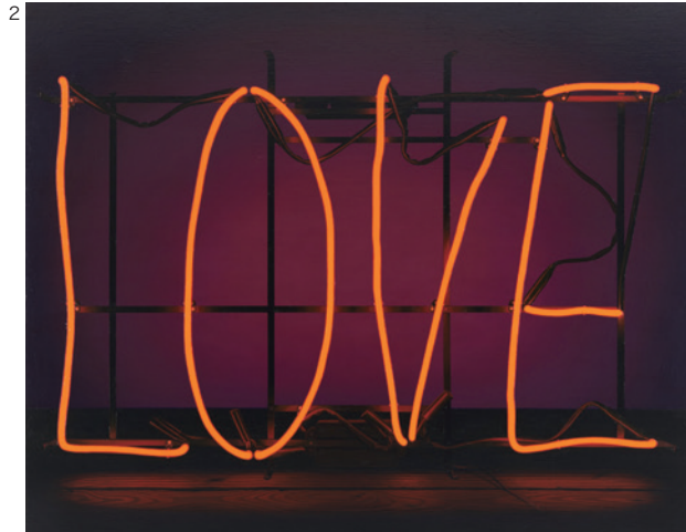
LOVE 2018 oil on linen 182 × 227.5 cm