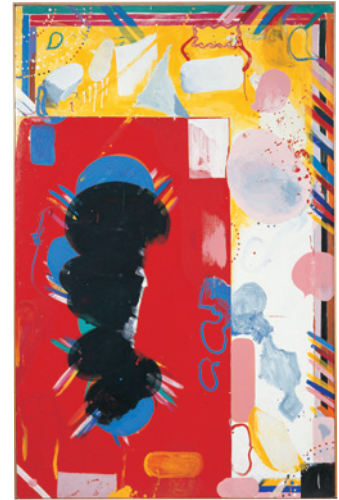
Work 1963 acrylic on canvas H212.2×W136.4cm collection of 21st Century Museum of Contemporary Art, Kanazawa