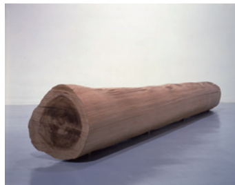
Wood No. 5 CJ 1984 cedar H58xW427xD53cm collection of 21st Century Museum of Contemporary Art, Kanazawa ©KADONAGA Kazuo