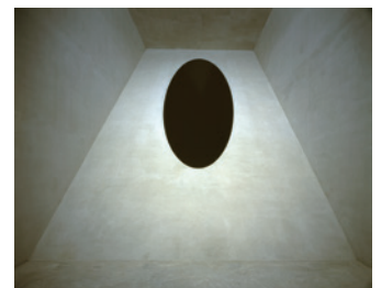
L'Origine du monde 2004 longer diameter of oval: 700cm collection of 21st Century Museum of Contemporary Art, Kanazawa © Anish Kapoor

Born in Mumbai, India in 1954. Lives and works in London, UK. After spending his childhood in India, Anish Kapoor went to England at the age of 17. From the late 1970's he began to exhibit his work. At the beginning he produced many sculptures covered with pigments on the surface. Later, these pigment works began to reveal openings, this led on to works which look like cave entrances, or a crack in the earth, covering the inside of a crevice or hole made in the bedrock-like floor with pigments. His works constructed with varied materials always urge us to reconsider our vision and usual perceptions. In the unknown world generated beyond dimensions, Kapoor's own views on human existence and life are reflected.