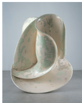
My Own 2001 marble H160xW230xD180cm collection: 21st Century Museum of Contemporary Art, Kanazawa © Tony CRAGG