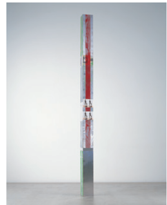
Lehmbruck 2000 wood, metal, aluminum foil, postcard H320xW20xD18cm collection of 21st Century Museum of Contemporary Art, Kanazawa © Isa GENZKEN photo: NAKAMICHI Atsushi / Nacasa & Partners

At the beginning of the 1980s, Genzken became known for her large-scale floor sculptures. Later she began to produce works using many different media, including oil painting, photography and film. She continues to produce pieces that place two opposing concepts on a single platform: roughness and delicacy, openness and closure, transparency and opaqueness, and so on. Genzken is an artist who juxtaposes careful calculations and unpredictability, and tries to make the two properly balanced.