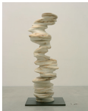
One Way or Another 2001 marble H247xW90xD90cm collection: 21st Century Museum of Contemporary Art, Kanazawa

Tony Cragg consistently keeps making works that reflect his insight into objects and the relationship between them. His approach is to examine the shape and function of a wide range of objects from the manmade to the natural world, and to reveal their deep connections. The arrangement of objects expresses a sense of organisms, in which a part becomes the whole and the whole becomes a part. He also pays attention to fluctuations in the usefulness and exchange value of objects according to their functions. In recent years, he has made many solid sculptures focusing on analyzing organic life forms.