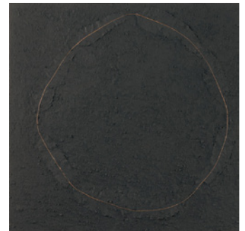
bacteria sign (circle) 2000 earth, dead leaves, acrylic on wooden panel H45xW45xD0.9cm collection of 21st Century Museum of Contemporary Art, Kanazawa © SUZUKI Hiraku

Born in Miyagi, Japan in 1978. Lives and works in Kanagawa. While working in diverse media, including two-dimensional work, sculpture, installation, live drawing, and video, Suzuki Hiraku uniformly explores “writing” and “drawing.” Discovering forms of all kinds—signage and words along roads, natural plants, artificial concrete fragments—he collects them, breaks them down, and reconstructs them in new lines and shapes. Suzuki also freely traverses genres, such as in collaborations with musicians and fashion designers.