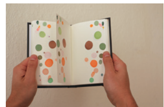
setting the butterfly free 2015 HD video, paper, watercolor pigment dimensions variable collection of 21st Century Museum of Contemporary Art, Kanazawa © KOGANEZAWA Takehito

Born 1974 in Tokyo (Japan), based in Hiroshima Prefecture. Koganezawa Takehito participated in the activities of Studio Shokudo while studying imaging arts and sciences at Musashino Art University and presented a video artwork at a group exhibition held in Yokohama in 1997. Soon after graduating he moved to Germany where he continued to live and work until early 2017. His work, which is centered on video but also encompasses performances, drawings and installations, has been shown widely both in Japan and overseas. It has won high acclaim for its keen insights into the subtleties of everyday life and the glimpses it offers of the mystery, unease, beauty, and humor that lie hidden beneath its surface.