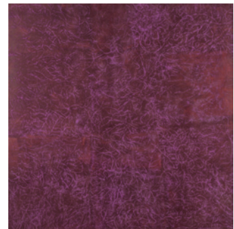
Amarante, from series Les Éclats 2004 pigments, pastels and binder on linen H250 x W250cm collection of 21st Century Museum of Contemporary Art, Kanazawa © Monique FRYDMAN

Monique Frydman, who is recognized as one of France's foremost women artists, became a practicing artist in the late 1970s. Focusing on painting as her primary medium, she explores color and light using such materials as canvas, pigments, pastels, cord, and paper. Her colors and images, emergent from an intimate, bilateral dialogue between her materials and own body, manifest fragments of memory and relics from her distant past – sometimes without her realizing it, and stir our own emotions and memory. In recent years, she has also undertaken site-specific installations using glass, plexiglass, paper, and cloth.