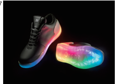
Orphe Black Model (ORPF - O1B)