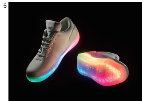
Orphe White Model (ORPF - 01W)