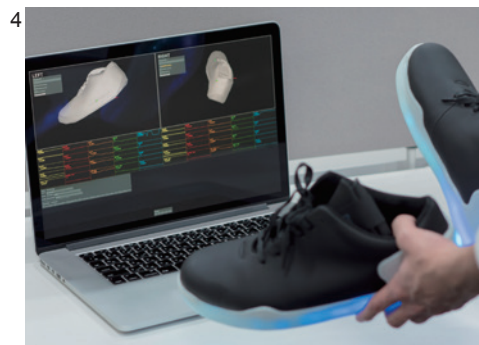
Packed with 9-axis motion sensors and a Bluetooth wireless module. Usable as musical instrument or controller in conjunction with various applications.

(Kikukawa Yuya, CEO, no new folk studio Inc.)