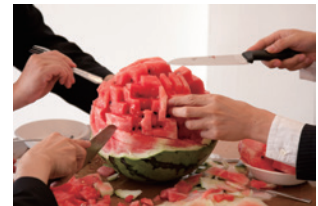
Chapter 4: I Love Xijing The Daily Life of Xijing Presidents 2009

This artwork depicts each of the Xijing Men handling national policy as president during 14 days. To make Xijing a prosperous, fun nation, they employ unique methods of visualizing and solving problems related to education, urban design, economic, territory, and food.