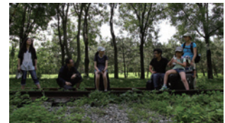
Chapter 3: Welcome to Xijing Xijing Immigration 2012

To enter the country of Xijing, one naturally must go through immigration. Xijing Men at the embassy provide disembarkation papers, items necessary for entry, and entry permit instructions. When we think of entering and exiting a country, we must by necessity consider the meaning of an invisible border and crossing that border.