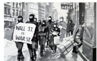
Ink Media 2012

Chen Shaoxiong has selected photographs from the Internet of historical events occurring in the period 1909 to 2009 and created more than 150 ink paintings. Presented are Ink History , a work summarizing his nation’s history of modernization in a roughly 3-minute long motion picture, and Ink Media , a work showing how people have stood up to resist authoritarian power and violence around the world.