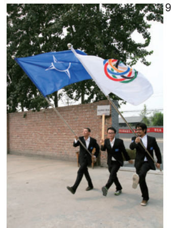
Chapter 3: Welcome to Xijing-Xijing Olympics 2008

Ozawa Tsuyoshi was born in Tokyo, Japan in 1965. His solo exhibitions include Answer with Yes and No! (Mori Art Museum, Tokyo, 2004), The Invisible Runner Strides On (Hiroshima City Museum of Contemporary Art, Hiroshima, 2009), The Return of Painter F (Shiseido Gallery, Tokyo, 2015). He has participated in group exhibitions such as the 50th Venice Biennales, The 5th Asia Pacific Triennial of Contemporary Art (Queensland Gallery of Modern Art, Brisbane, 2006), Prospect 2 (The Contemporary Arts Center, New Orleans, 2011).