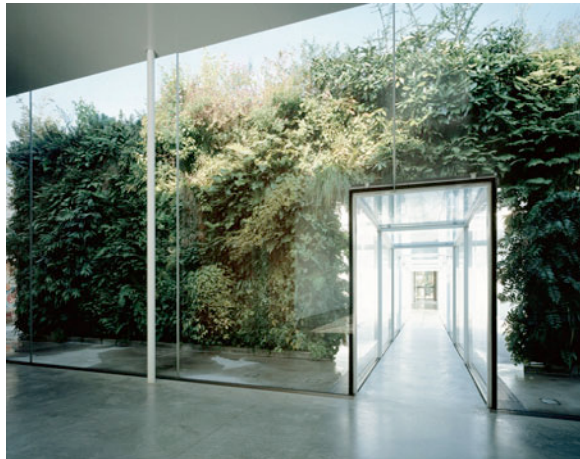
Patrick BLANC, Green Bridge 2004 plant, PVC, felt, steel H468 x W1258 x D14cm

collection 21st Century Museum of Contemporary Art, Kanazawa