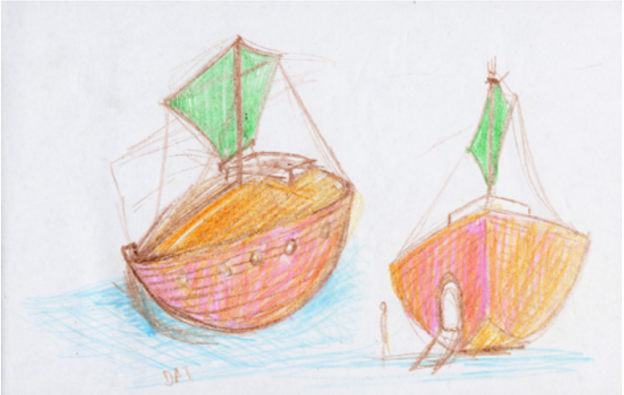
Katsuhiko HIBINO 《SHIP of SEED 2》 2007

Kanazawa Youth Dream Challenge Art Programme