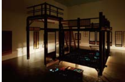
TAKAMINE Tadasu, Good House, Nice Body: Those who built me and passed me by , 2010 Collection of 21st Century Museum of Contemporary Art, Kanazawa