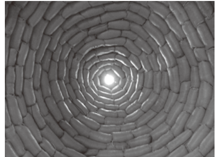
Earthbag library in West India, D Environmental Design System Laboratory