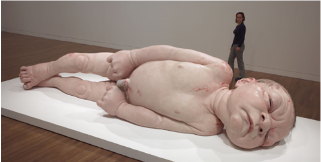
Ron Mueck A Girl , 2006 National Galleries of Scotland, Edinburgh © Artist