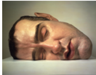
Ron Mueck, Mask II , 2001-02 Private Collection, London © Artist Courtesy: Anthony d'Offay, London