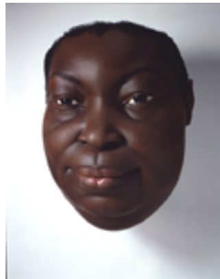
Ron Mueck, Mask III , 2005 Private Collection, London © Artist Courtesy: Anthony d'Offay, London