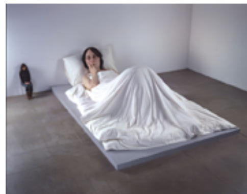
Ron Mueck, In Bed , 2005 Queens Land Art Gallery, Brisbane