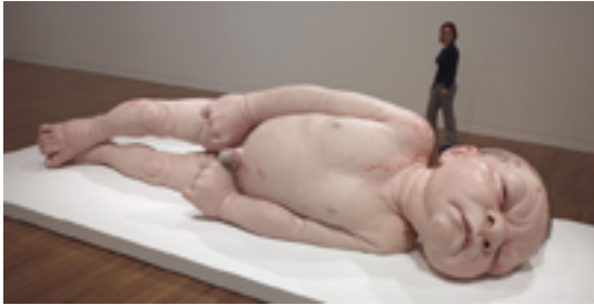
Ron Mueck, A Girl , 2006 National Galleries of Scotland, Edinburgh © Artist Courtesy: National Gallery of Canada, Ottawa

* Please specify the following credits when you publish any of the pictures.