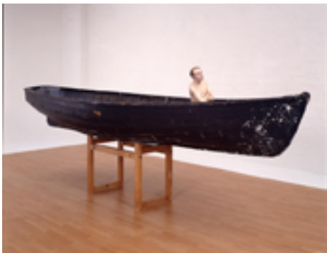
Ron Mueck, Man in a Boat , 2002 Anthony d'Offay, London