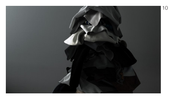
WATANABE Go, jumbled mountain , 2016 Collection of the artist ©Go Watanabe, Courtesy of ANOMALY

Watanabe earned his MFA in oil painting at Aichi University of the Arts in 2002. He uses 3DCG to make animations that exhibit movements and changes that defy the laws of light and matter. The inconsistent state of things and behavior of light brought by his works disturb the world we take for granted, and quietly ask exactly what it is we are seeing. Major group exhibitions include Aichi