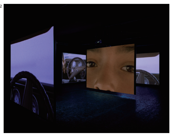
Doug Aitken, i am in you , 2000, Installation view: Galerie Hauser & Wirth & Presenhuber, Zürich, 2000, © Doug Aitken, Courtesy of the artist; 303 Gallery, New York; Galerie Eva Presenhuber, Zürich; Victoria Miro Gallery, London; and Regen Projects, Los Angeles

Doug Aitken is known for an incredibly diverse body of work ranging from video, photography, sculpture and architectural interventions, to sound, installation, and film offerings. i am in you is a 5-screen video installation. Amid everyday scenes of American suburbia, people, nature, manmade objects, and geometric designs overlap deftly with a young girl's whispering voice, hands clapping in rhythm, and a piano melody, drawing the viewer inexorably into the flow of hallucinatory images on the video. As these images repeat continuously, fragmenting without providing any firm narrative contours, the audience feels the power and speed of this elusive state of flux at a visceral level, experiencing the work as a wandering journey through a vortex of visuals and sound. This is a stunning opportunity to experience first-hand the dynamism of a Doug Aitken video installation in the spacious surroundings of the 21st Century Museum of Contemporary Art, Kanazawa.