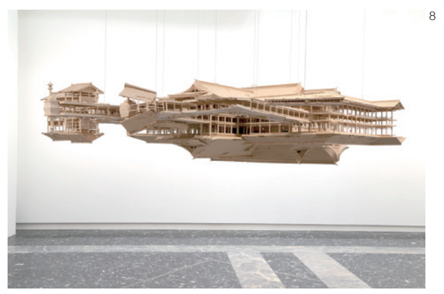
IWASAKI Takahiro, Reflection Model (Ship of Theseus), 2017 Collection of 21st Century Museum of Contemporary Art, Kanazawa ©Takahiro Iwasaki, Courtesy of ANOMALY

Born 1975 in Hiroshima, Iwasaki Takahiro is known for works that challenge viewer perceptions by taking the likes of historic buildings, pylons and cranes, shrinking them, and replacing their materials with others of different textures and robustness. In this exhibition, Iwasaki will use new works with a tagasode (lit. "whose sleeves?) motif and others to suggest an ordinary altered by the pandemic, and at the same time, highlight an ordinary that takes change on board and thus persists, through the work Reflection Model ( Ship of Theseus ), in which real and mirror images of the damaged Itsukushima Shrine are constructed from cypress.