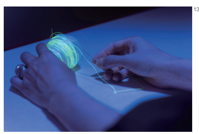
TAKEMURA Kei, Renovated: T. Family's Light Bulb, Performance view at Yokohama Triennale 2020

Born 1975 in Tokyo. In her "Renovated" series in which the artist wraps broken or "wounded" everyday objects in semitransparent fabric and embroiders over the damaged parts, and installations overlaying embroidered white cloth on drawings and photographs, Takemura attempts to capture things such as memories and landscapes prone to being forgotten, things that change, and objects that break, like household items, through the act of stitching. Here she will present works from the "Renovated" series made using glowing fluorescent silk thread, and also repair works on-site at irregular intervals throughout the exhibition.