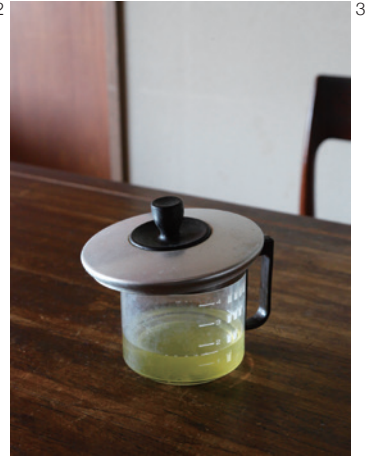
IWASAKI Takahiro, Out of Disorder (Coney Island), 2012