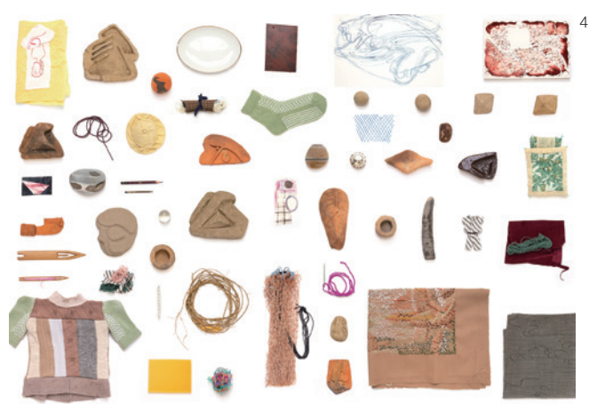
AOKI Ryoko + ITO Zon, From the exhibition: WORKSHOP FREE MOLECULES METAMORPHOSES, The Watari Museum of Contemporary Art, 2020

Participating artists range from emerging artists born in the 1980s, to mid-career practitioners born in the 1970s, and veterans of 1960s vintage, presenting the kind of everyday things that happen to everyone, in a variety of media including photography, video, sculpture, drawing, embroidery, pictures and words. These are artists based not only in Japan's major metropolises, but also in smaller centers and rural areas, and their creative acts are intimately tied to their day-to-day routines.