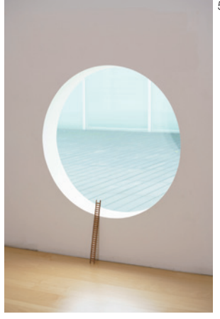
TAKADA Akiko & Masako, A Ladder (Ruler I) , 2019 Collection of the Artist