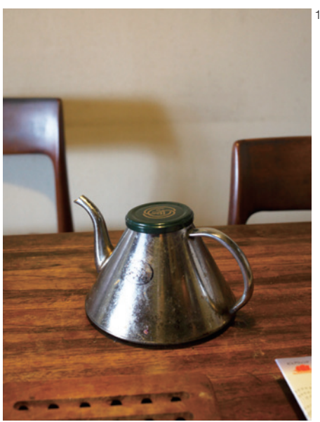
SHITAMICHI Motoyuki, Mother's Covers , 2012 Collection of the Artist

Born 1978 in Okayama, Shitamichi homes in on unusual things buried in the day-to-day, such as wartime relics, boulders washed up by tsunami, and bridges over narrow canals and ditches in city streets, carrying out exhaustive research on these finds and presenting the results in photos, video, and text. At this exhibition he will present works that track unusual scenes people are unaware of amid the ordinary, and the kind of creative acts people engage in unconsciously, in a display centered on the works Mother's Covers , which captures the act of his mother-in-law appropriating items that happen to be at hand for lids, and 14 years old \square and \square , in which middle school students were asked to research the phenomenon of broken things in their homes being fixed or compensated for by other objects.