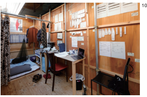
Advertising Sign House: Takamatsu, 2019