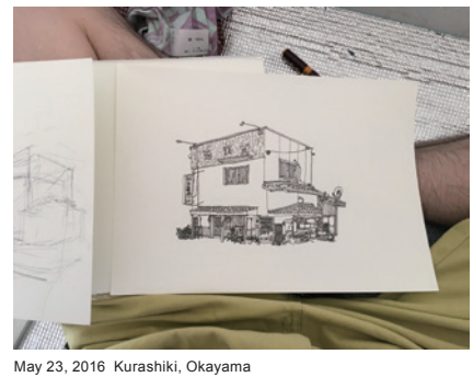
May 23, 2016 Kurashiki, Okayar