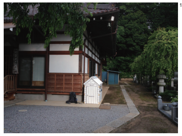
June 7, 2015 Buddhist temple in Nagareyama, Chiba

We anticipate that these works employing unique methods to convey the doubt and unease the artist has sensed in society, and offering a place for discussion, will encourage us to confront what it means to live in Japanese society since the Tohoku quake, reawakening our own powers of thought around many related issues.