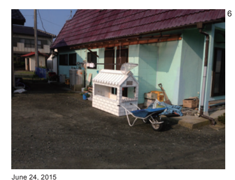
Under the eaves of the Yamana guesthouse in Nakosomachi, Iwaki, Fukushima