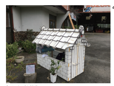
September 21, 2017 The driveway of a farmhouse in Asomura, Kumamoto