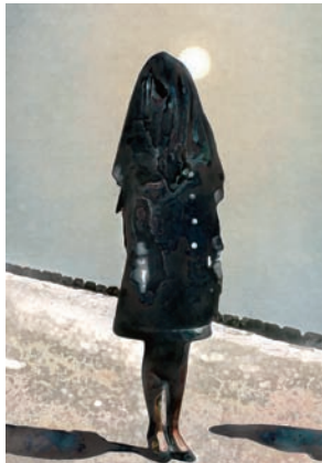
Makoto Saito Sun 2006 Acrylic and oil ink on canvas 190 x 132 cm © Makoto Saito