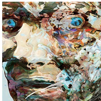
Makoto Saito Face Cut Out 2007 Acrylic and oil ink on canvas 60 x 60 cm © Makoto Saito