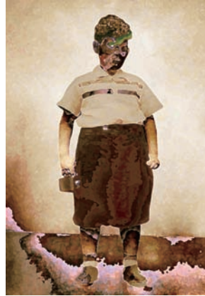
Makoto Saito Kubrick Adolescence 2007 Acrylic and oil ink on canvas 220 x 152.8 cm © Makoto Saito