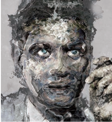
Makoto Saito The Man 2007 Acrylic and oil ink on canvas 160 x 146.8 cm © Makoto Saito