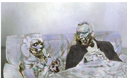
Makoto Saito Meeting 2007 Acrylic and oil ink on canvas 135 x 220 cm © Makoto Saito