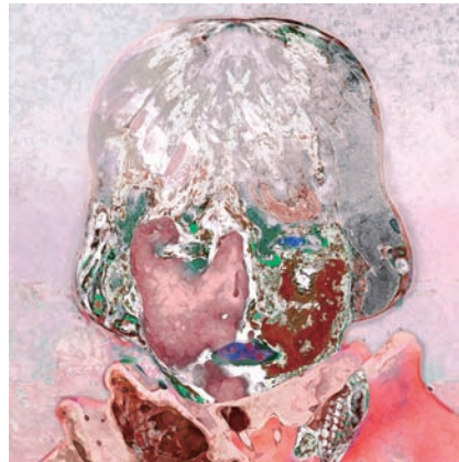
Makoto Saito Doll 2007 Acrylic and oil ink on canvas 115 x 115 cm © Makoto Saito