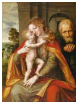
Jan MASSIJS The Holy Family 1563 Royal Museum of Fine Arts Antwerp