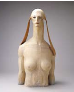
FUNAKOSHI Katsura The Sphinx Sees War 2005 Private Collection © Katsura Funakoshi photo: UCHIDA Yoshitaka courtesy: Nishimura Gallery