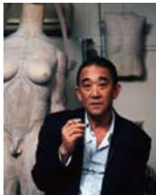
FUNAKOSHI Katsura

Born in Antwerp, Belgium in 1958 and currently lives in the same city. Jan Fabre is known as an artist who has been active in a multidisciplinary genre such as art, drama, opera and performance. His consistent theme for production has been the search of life and death through drawings structured by close observation of insects such as spiders, sculptural pieces using dead animals and stuffed animals, and performances using blood and salt.