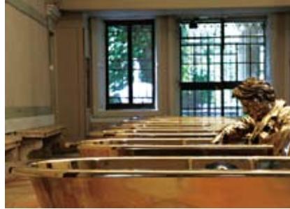
Jan FABRE The Man Writing on Water 2006 galerie guy pieters, Belgium