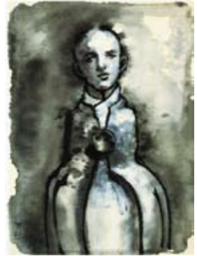
FUNAKOSHI Katsura Drawing for "Touch of Winter" 1997 Collection of the Artist © Katsura Funakoshi