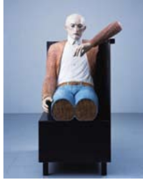
FUNAKOSHI Katsura No hurried Pendulum 2010 collection: Nishimura Gallery © Katsura Funakoshi