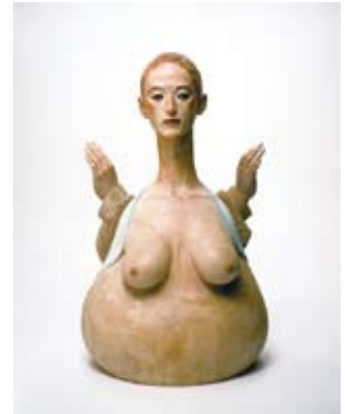
FUNAKOSHI Katsura A Lunar Eclipse on the Water 2003 Collection of the Artist © Katsura Funakoshi