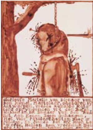
Jan FABRE Self-portrait of the hanged 1999 Fondation Raimunda Munoz Ortega, Mula (Spain)