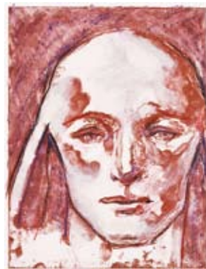
FUNAKOSHI Katsura The Sphinx, Watching the War (production process) 2005 Collection of the Artist © Katsura Funakoshi