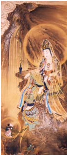
KAWANABE Kyosai Jibo Kannon (Avalokitesvara as a Merciful Mother) c.1883 Japan Ukiyo-e Museum