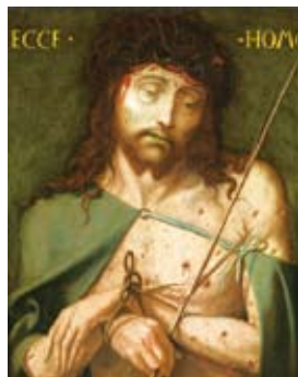
Anonieme Meester Ecce Homo 16th century Royal Museum of Fine Arts Antwerp