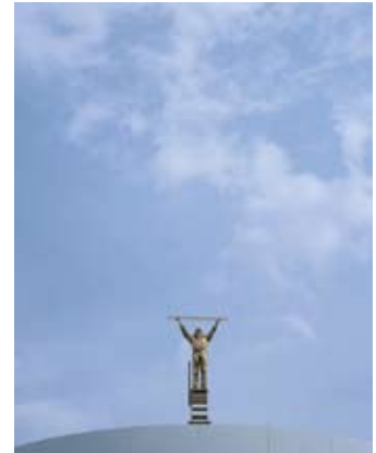
Jan FABRE The Man Who Measures the Clouds 1997 21st Century Museum of Contemporary Art, Kanazawa © Angelos / Jan Fabre photo: NAKAMICHI Atsushi / Nacása & Partners