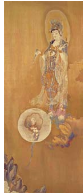
KAWASHIMA Jinbei II Tapestry panel "Avalokitesvara as a Merciful Mother" 1895 Tokyo National Museum