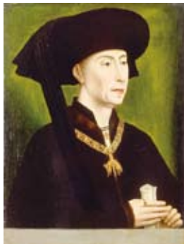
Rogier van der WEYDEN (d'après) Philip the Good, Duke of Burgundy (1396-1467) Musée du Louvre, département des Peintures, MI 818.