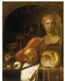
Jan DENENS Vanitas 17th century Royal Museum of Fine Arts Antwerp