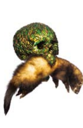
Jan FABRE SKULL 2001 private collection © Angelos / Jan Fabre