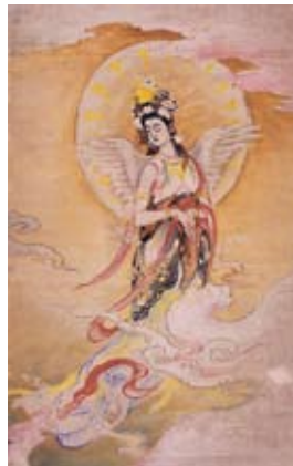
KANO Hogai Apsaras in flight Meiji period Shimonoseki City Art Museum