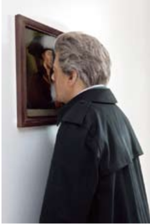
Jan FABRE Ik laat mezelf leeglopen (dwerf) (I let myself deflate (dwarf)) 2007 AD Gallery, Athens Painting: Rogier van der WEYDEN (d'après), Philip the Good, Duke of Burgundy (1396-1467) Musée du Louvre, département des Peintures, MI 818.