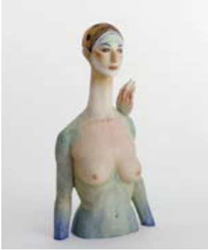
FUNAKOSHI Katsura By the Water, deep in the forest 2009 collection: Nishimura Gallery © Katsura Funakoshi