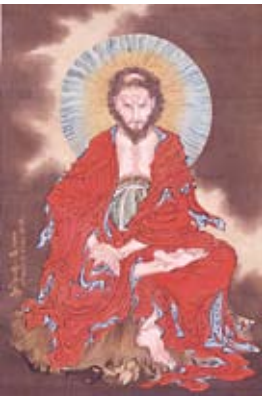
KAWANABE Kyosai The Buddha 1876 Musée Guimet