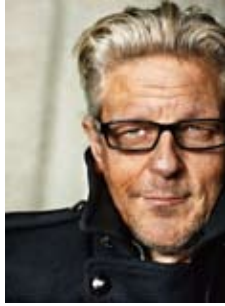
Jan FABRE