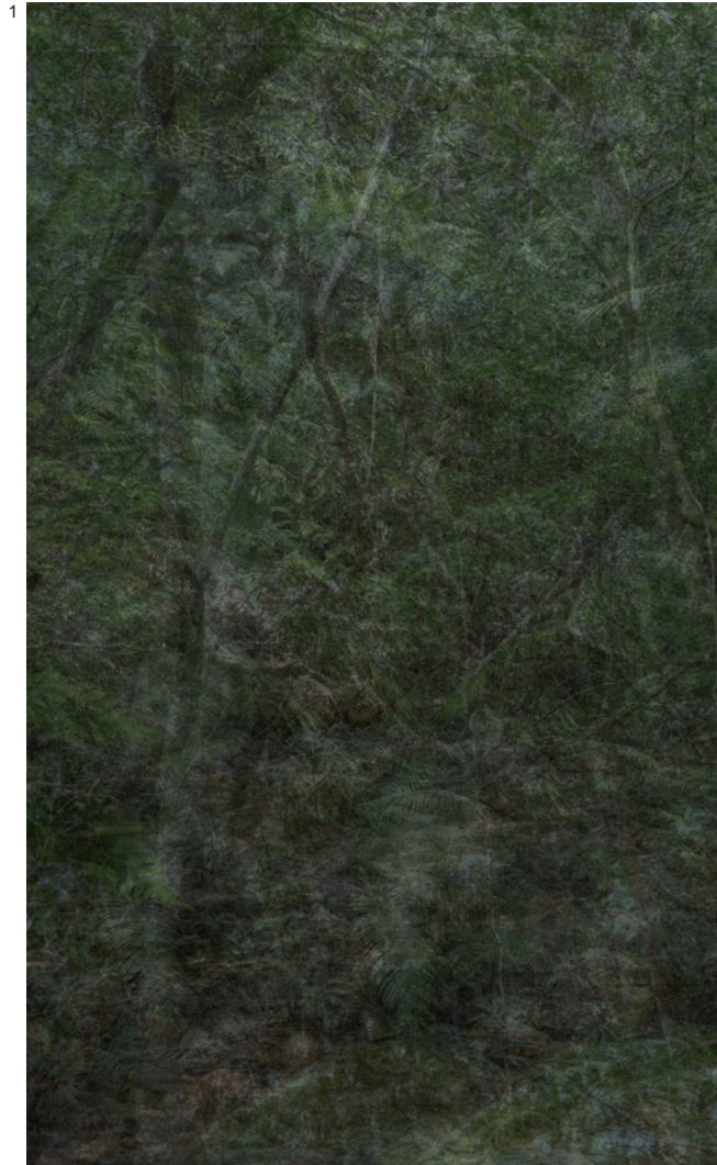
GU Kenryou, Mori, Shades_dw_001 , 2023