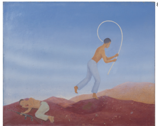
Francis Alÿs, The Consequence of Ignorance , 1997 © Francis Alÿs