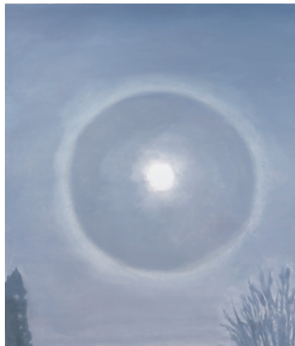
Luc Tuymans, Double Sun, 2006

Part 2 will feature Francis Alÿs, whose dominant theme to date has been that of “walking,” and consist of allegorical paintings positioned randomly on the gallery walls. In these works, part of the artist’s “Déjà Vu” series, humans and animals in bizarre walking poses float amid bleak blue landscapes, like scenes from a dream or vision. In the calm quiet of their works, which invite deep introspection on the part of the viewer, can also be identified the blue tradition of the Flemish painting that once flourished in the homeland of these two artists.