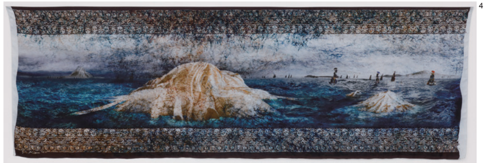
Yee I-Lann, The Orang Besar Series – Empires of Privateers and Their Glorious Ventures , 2010 © Yee I-Lann

In Part 2, the gallery will be occupied by two works: Sugimoto Hiroshi’s Sea of Japan, Rebun Island , and Curtain of Mist by Fukumoto Shihoko. In that they are black and white, Sugimoto’s “Seascapes” half-sea, half-sky series of photographs evoke exquisitely the spiritual expansiveness of the color blue. The shimmering indigo ombre of Fukumoto’s aizome-dyed curtain meanwhile will bring to mind scenes of mountains glimpsed amid hanging mist, and the profundity of abstract spaces.