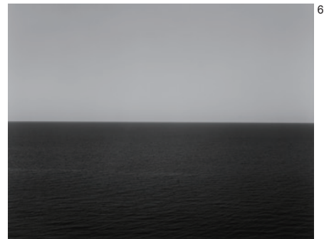
Hiroshi Sugimoto, Sea of Japan, Rebun Island , 1996 © Hiroshi Sugimoto, courtesy Gallery Koyanagi, Tokyo