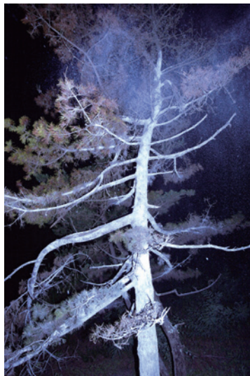
Lieko Shiga, rasen kaigan 36 , from the series "RASEN KAIGAN," 2010

The final gallery will display works that offer premonitions of openings to other realms beyond the visible world. Lieko Shiga's "RASEN KAIGAN" series was born out of Shiga's efforts to get close to the land and the bodies of the people living there following a move to Miyagi in 2008. Ghostly blue light appears in images fixed by photography, evoking a world outside of life lurking in the background of human endeavor and the natural world. Rosemary Laing's "Flight Research" series of photographs and Peter Newman's video Free at Last are freewheeling works showing human figures who have launched themselves into the air. In the former, a woman wearing a wedding dress, alluding to a transformed innocence, floats in the skies above the Blue Mountains on the outskirts of Sydney, while in the latter, a skydiver adopts a pose from the introspective meditation practice of yoga. Positioned at the furthest limits of life amid boundless blue skies, their bodies seem to have acquired the ultimate in freedom.