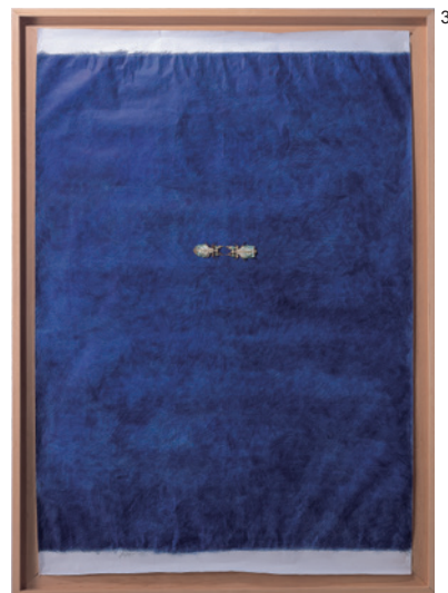
Jan Fabre, Walking Leaves, 1992