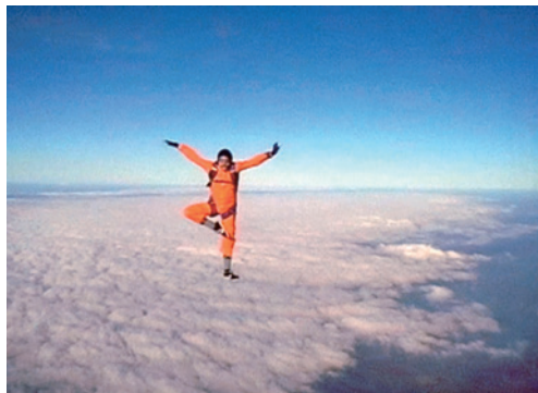
Peter Newman, Free at Last , 1997 © Peter Newman