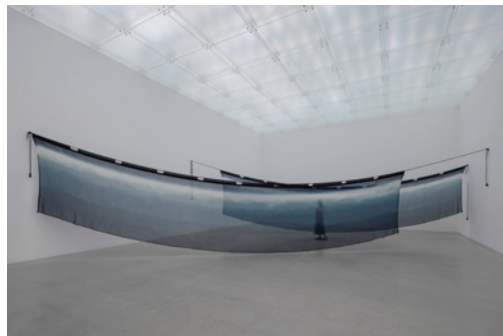
Shihoko Fukumoto, Curtain of Mist , 2002 © Shihoko Fukumoto