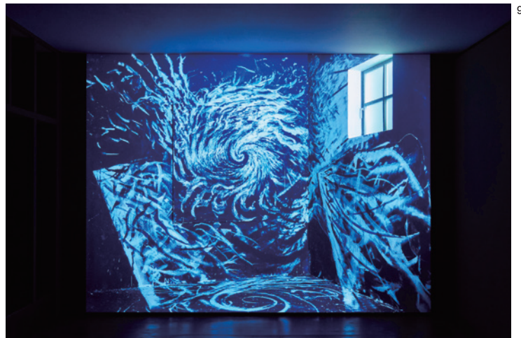
Takashi Ishida, Between Tableau and Window , 2018 © Takashi Ishida, Courtesy of Taka Ishii Gallery

As guest artist for “BLUE” we welcome painter and film artist Takashi Ishida, whose video installation Between Tableau and Window will unfold in a large gallery space. This work comprising a 4'33" projection, a 16mm film piece approximately half this length, and a painting that appears in both, is shot through with drawings layered in blue and white. Light from the window and frantically flickering artificial light overlap on organic lines and geometric forms that appear and disappear between the dual rectangles of painting and window, inviting us to experience a primordial moment in painting and video, in which drawing and viewing are condensed. For this presentation of Between Tableau and Window the window of the gallery and light-reflecting floor will also be incorporated in the work, creating a space suffused with blue light and darkness.