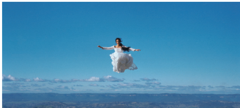
Rosemary Laing, Flight Research #5 , 1999 © Rosemary Laing

We are confident it will also shed new light on works on permanent exhibit at the Museum such as Leandro Erlich’s The Swimming Pool , James Turrell’s Blue Planet Sky , and Anish Kapoor’s L’Origine du monde . Also on display will be work by our guest artist for the exhibition: painter and film artist Takashi Ishida, creator of distinctive drawing animations striking in their use of blue coloring and light. Come experience for yourself the myriad tapestries of blue woven by a fascinating and diverse lineup of artist.