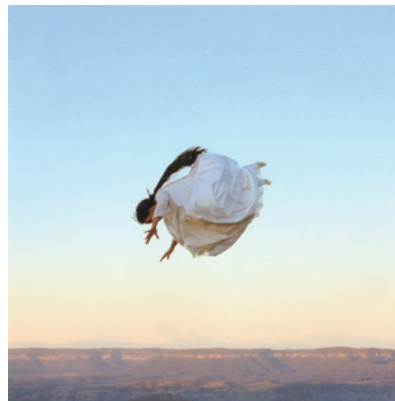
Rosemary Laing, Flight Research #9 , 1999 © Rosemary Laing