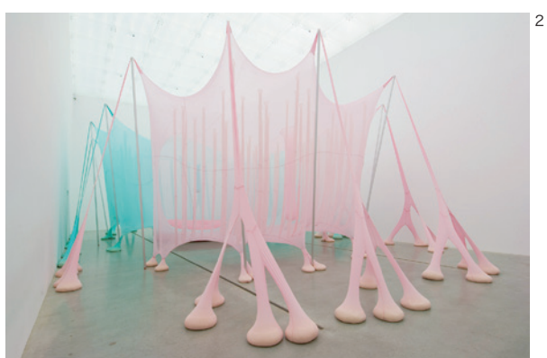
Ernesto NETO BODY SPACE NAVE MIND 2004 © Ernesto NETO *Where We Now Stand [1] only

Please send a publication (paper), URL, DVD or CD to the museum for our archives, afterwards.