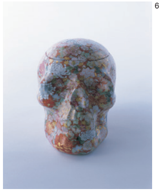
Kamide Choemon-gama + Maruwakaya "The Skull" Candy Jar with Design of Flowers 2009 © Kamide Choemon Gama © Maruwakaya "Where We Now Stand [2] only