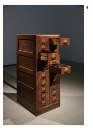
Janet CARDIFF & George BURES MILLER The Cabinet of Curiousness 2017 © Janet CARDIFF & George BURES MILLER "Where We Now Stand [1] only