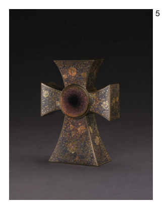
Unryuan, KITAMURA Tatsuo Cross, sarasa design, maki-e 2007 © Unryuan, KITAMURA Tatsuo photo: WATANABE Osamu *Where We Now Stand [2] only