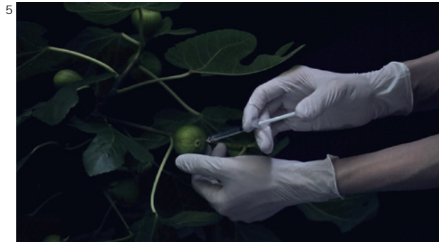
Breeding Institution (detail) 2018