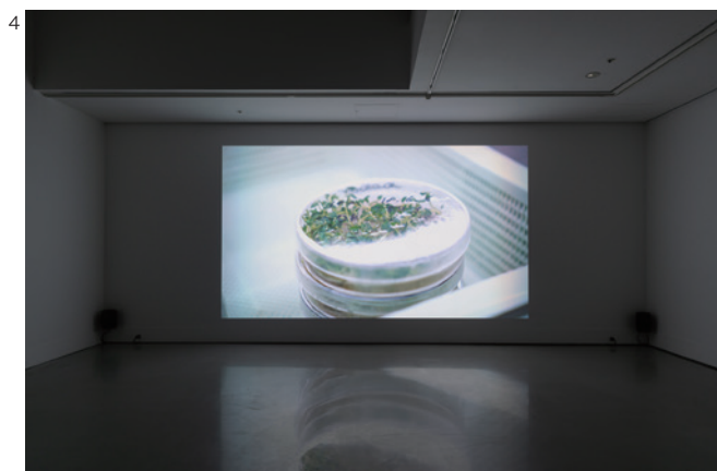
"shiseido art egg 12: Koichi Sato," Shiseido Gallery.