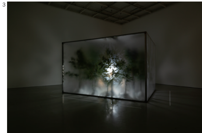
"shiseido art egg 12: Koichi Sato," Shiseido Gallery.

Soon, the order of the garden will likely be disturbed as we come into contact with whatever is outside the wall. But I don't view the collapse of the wall entirely negatively. The destruction of our order is also the restoration of an order "that is not us," the restoration of subjectivity. I want to see the elegance, sensuality and love that emerge due to the retreat of human things. A garden of a leaden hue that is neither day nor night, a freezing fjord turning into liquid. I imagine us slithering across the earth, having transformed into something resembling wild animals or plants.