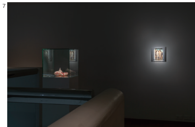
"shiseido art egg 12: Koichi Sato," Shiseido Gallery.