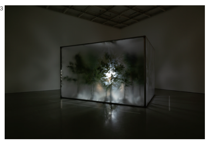
"shiseido art egg 12: Koichi Sato," Shiseido Gallery.

Soon, the order of the garden will likely be disturbed as we come into contact with whatever is outside the wall. But I don't view the collapse of the wall entirely negatively. The destruction of our order is also the restoration of an order "that is not us," the restoration of subjectivity. I want to see the elegance, sensuality and love that emerge due to the retreat of human things. A garden of a leaden hue that is neither day nor night, a freezing fjord turning into liquid. I imagine us slithering across the earth, having transformed into something resembling wild animals or plants.