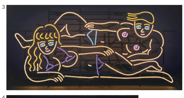
Sexy Man and Sexy Woman 2018 oil on linen 194 × 400 cm

Using neon tubing, she creates her design—the reclining figures of a man and woman, a cross, or the letters LOVE—then paints it on canvas. Depicted is the beautiful light of the neon tubes, manifest from darkness, and behind it, their "unsightly" wiring, power cords, and mounting. By giving equal attention to the bright light of the neon tubes and the hardware normally hidden at the back, she exposes the essential truth behind the pretense and elevates primordial beauty and meaningful existence to prominence.