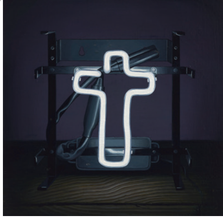
Cross 2018 oil on linen 46 x 46 cm