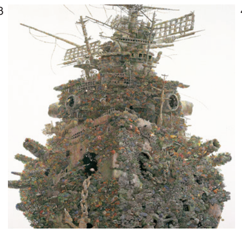
pen and ink on paper, mounted on board Hamamatsu Municipal Museum of Art