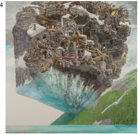
pen and ink on paper, mounted on board Chazen Museum of Art