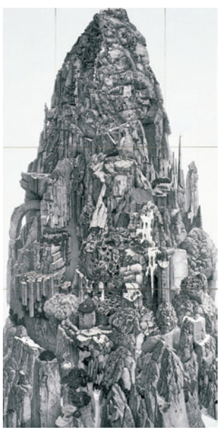
King of Rocks, 1998 pen and ink on paper, mounted on board 195×100cm The Obuse Museum & The Nakajima Chinami Gallery