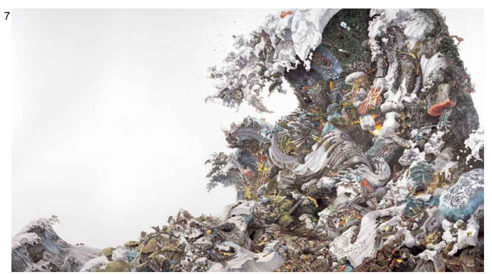
Foretoken, 2008 pen and ink on paper, mounted on board 190×340cm KAGURA Salon / Sustainable Invester CO., Ltd.