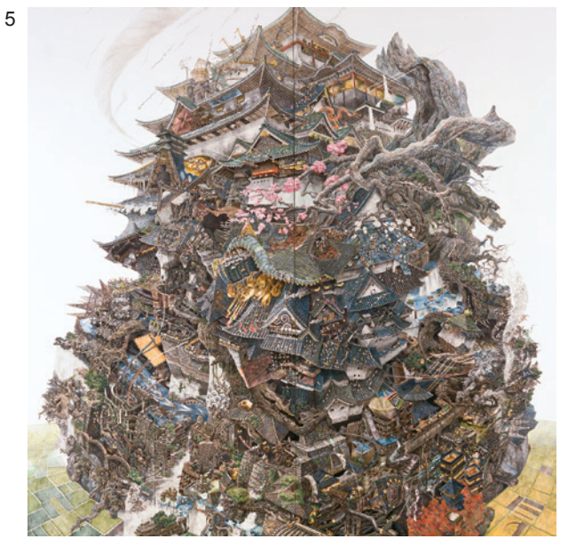
History's Rise and Fall, 2006 pen and ink on paper, mounted on board 200×200cm TAKAHASHI COLLECTION

Thank you for your understanding and cooperation in advance.