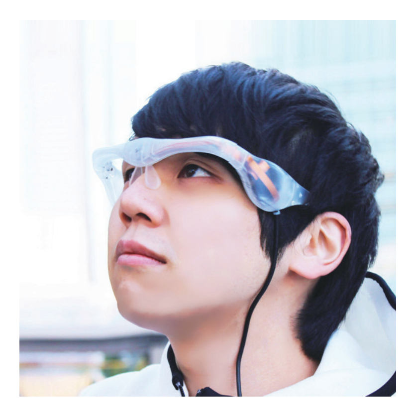
lab.1 OTON GLASS