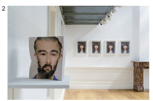
Installation view: Solo exhibition "Index," 2014 (Foam Museum, Amsterdam)