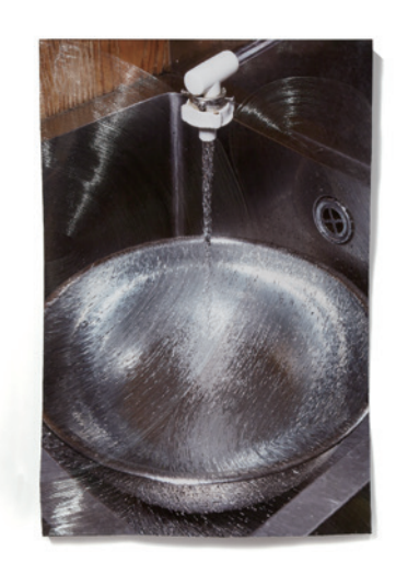
Scene to know No.023, 2013 (reference image)