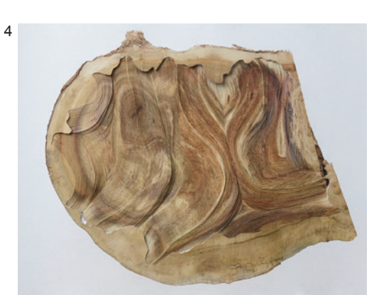
multiple - roadside tree no. 03, 2016