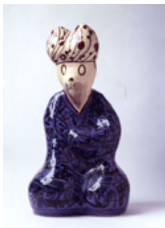
Wise Alan 2007 Glazed ceramic