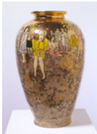
Precious Boys 2004 Glazed ceramic Collection of Victoria and Warren Miro