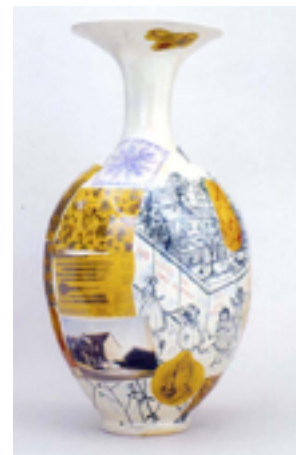
Plight of the Sensitive Child 2003 Glazed ceramic Collection of 21st Century Museum of Contemporary Art, Kanazawa