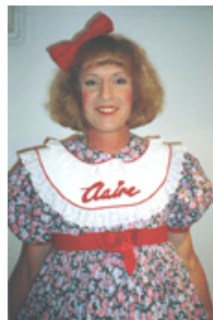
Portraits of Grayson Perry (both)