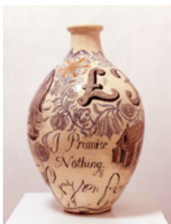
I Promise Nothing 2007 Glazed ceramic