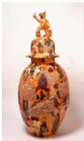
What's not to like? 2006 Glazed ceramic