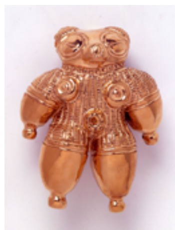
Prehistoric Gold Pubic Alan 2007 Glazed ceramic