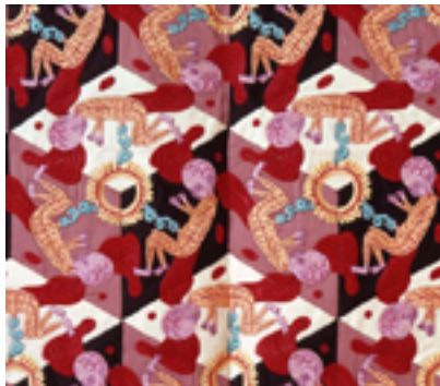
Right to Life (detail) 1998