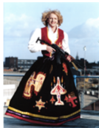
Claire as the Mother of All Battles 1996 Photographic print