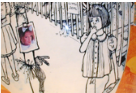
Plight of the Sensitive Child (detail) 2003 Glazed ceramic