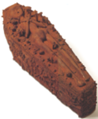
Angel of the South 2005 Cast iron