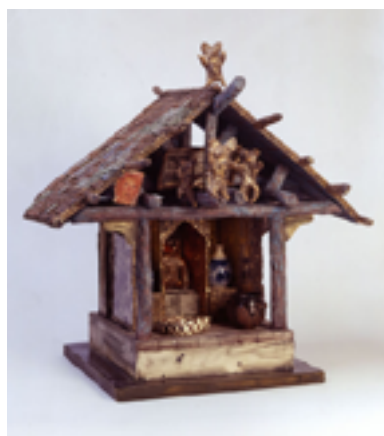
Shrine to Alan Measles 2007 Glazed ceramic