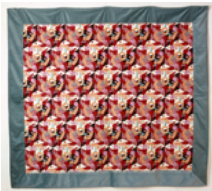
Right to Life 1998 Cotton, rayon, computer controlled embroidery