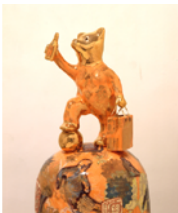
What's not to like? (detail) 2006 Glazed ceramic