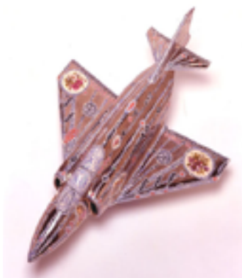
Model Jet Plane X92 1999 Glazed ceramic