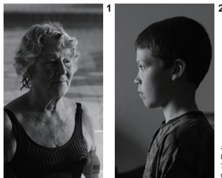
Seven, 2011 Digital installation 7 Hours Collection of the Artist