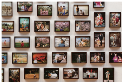
Vox Populi Tokyo , 2007 Photographic installation Collection of the Artist