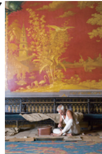
A Lapse of Memory , 2007 HD Installation 24min. 35sec. Collection of the Artist