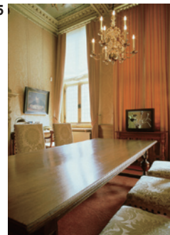
Linnaeus' Flower Clock , 1998 Video 17 min. Collection of 21st Century Museum of Contemporary Art, Kanazawa