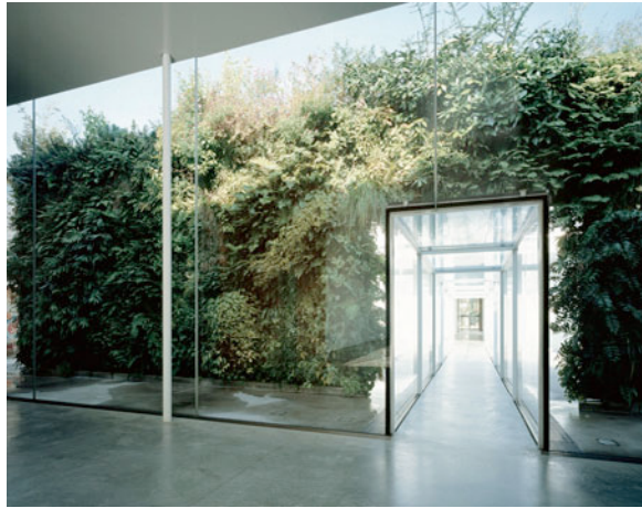
Patrick BLANC, Green Bridge plant, PVC, felt, steel H468 x W1258 x D14cm

21st Century collection Museum Contemporary Art, Kanazawa