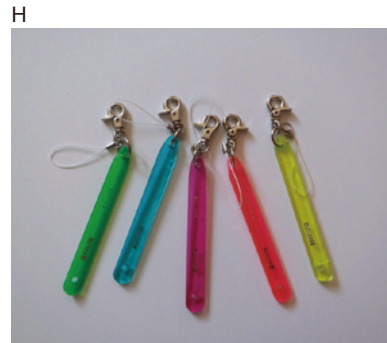
H The Ossu! Shugeibu Toothbrush? ... Strap! , 2007