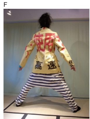
F The Ossu! Shugeibu re-ma-ke: Metropolitan Expressway Co., Ltd., Sarrouel , 2010