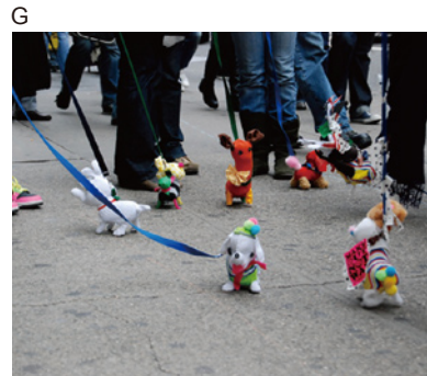
G The Ossu! Shugeibu Robogurumi, Bukatsu workshop , 2004