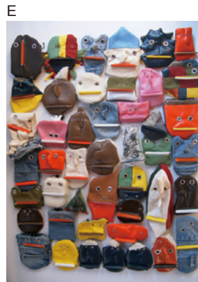
E The Ossu! Shugeibu Kao-pass , 2004