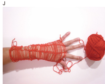
J The Ossu! Shugeibu Arm-yarn , 2009