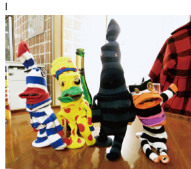
I The Ossu! Shugeibu Taberu , 2008