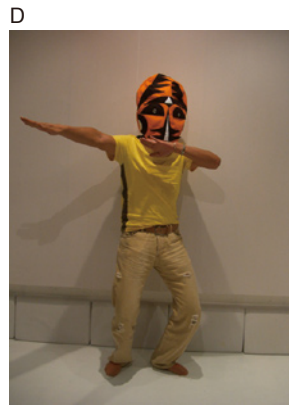
D The Ossu! Shugeibu Ranger 5 , 2004