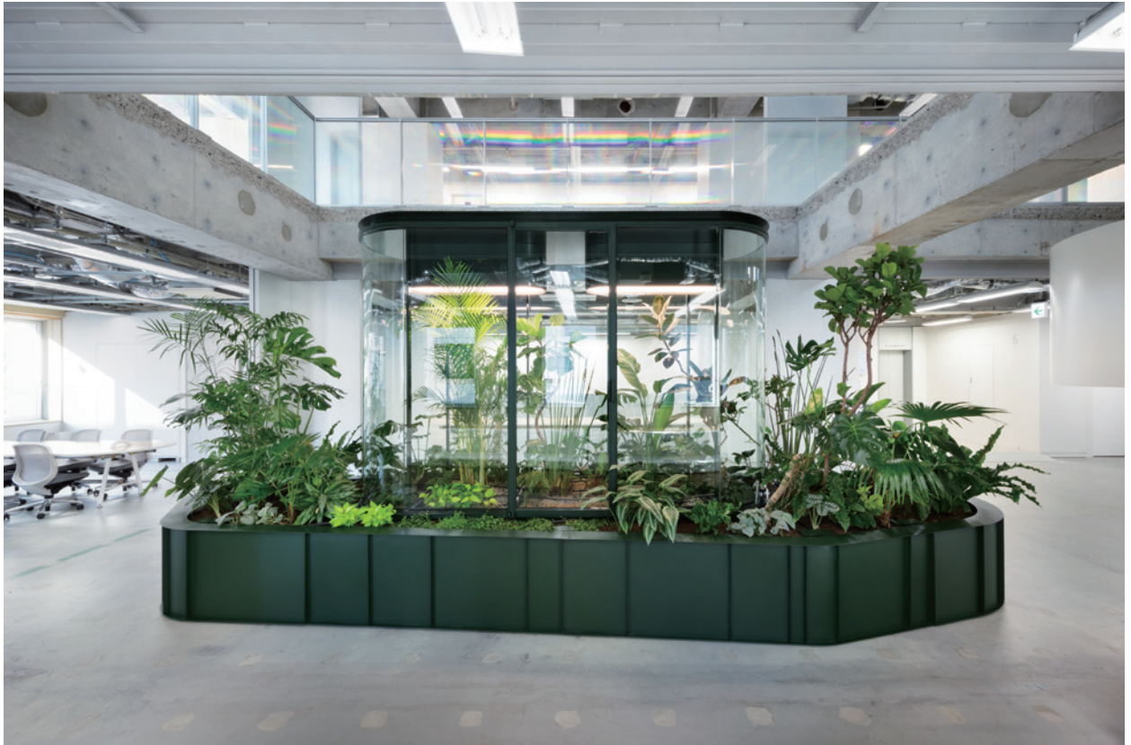
Fabbrica dell'Aria® PNAT 2023

We are surrounded by animals, plants, and all manner of other things that lie within our grasp. We have a desire to overcome the problems of the Earth as if we were dancing with all of the forms of existence that surround us. This year, the 21st Century Museum of Contemporary Art, Kanazawa will hold this exhibition in response to the annual theme of new ecologies as it celebrates its 20th anniversary. Through the keen sensitivities and faculties of observation of artists, this exhibition will present the future of a comprehensive ecological theory with the capacity to take into account society and the psyche. In collaboration with scientists, philosophers, and other researchers who share the same vision, the exhibition will visualize a range of specialized content and imbue it with sensitivity, conveying it to viewers as a form of sensory learning. Artists and creators from Africa, South America, Asia, Europe, and the United States, including those in remote areas, will gather in the space of the museum to share their wisdom on how to survive alongside life and living beings, as if we were dancing with each other. This vision that encompasses all things in Kanazawa, the birthplace of D.T. Suzuki, will serve as a platform for symbiotic relationships.