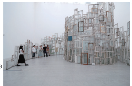
6. Sarah SZE, The Art of Losing , 2004, © Sarah SZE 7. FUJI Hiroshi, Happy Paradise , 2015, © FUJI Hiroshi, photo: KIOKU Keizo 8. Pedro REYES, pUN Library , 2013, photo: KIOKU Keizo 9. James TURRELL, Gasworks , 1993, © James TURRELL photo: SAIKI Taku 10. MURAKAMI Takashi, Sea Breeze , 1992 ©1992 Takashi Murakami / Kaikai Kiki Co., Ltd. All Rights Reserved. 11. KANEUJI Teppei, Endless, Nameless #1 , 2014 © KANEUJI Teppei, photo: KIOKU Keizo 12. UJINO Muneteru, Plywood Shinchi , 2017–2019, photo: KIOKU Keizo 13. HIROSE Mitsuharu × NISHIYAMA Minako, Knit Pavilion – Knit Cafe in My Room , 2009 © HIROSE Mitsuharu © NISHIYAMA Minako, photo: SAIKI Taku 14. SHIOTA Chiharu + OKADA Toshiki, About A Room of Memory , 2009 © SHIOTA Chiharu © OKADA Toshiki, photo: IKEDA Hiraku

All images are Collection of 21st Century Museum of Contemporary Art, Kanazawa.