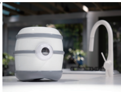
Rice bran pickling bed robot that can converse with humans