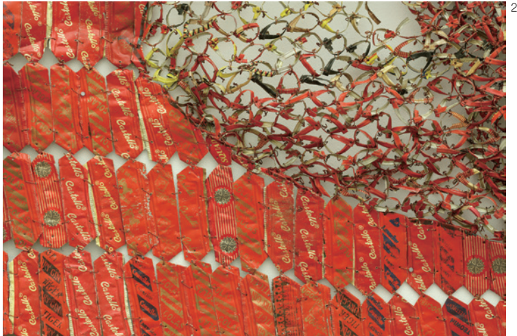
EI ANATSUI, 2015 © EI ANATSUI

June 22 (Sat) – October 14 (Mon/holiday)