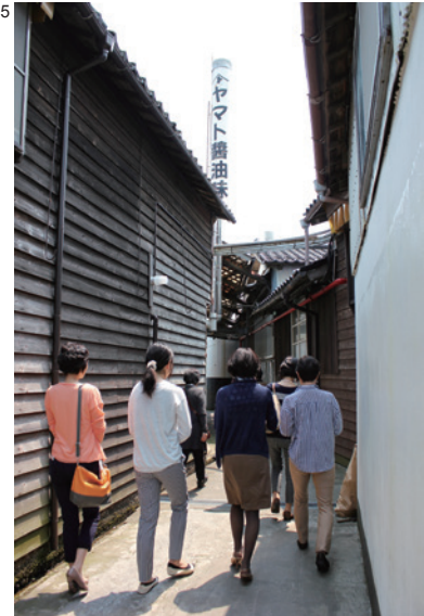
People touring Ono, a town of fermented foods

In FY2024, the 20th anniversary of the museum, we will propose a new type of tourism that combines art and design, fermented food, and walks through the city, in collaboration with breweries in Kanazawa. Soy sauce and sake are representative of Japan's culture of fermented foods. Kanazawa is home to many breweries with a history of several hundred years, and a unique fermentation culture nurtured by the city's marine culture that includes kaburazushi (yellowtail sandwiched between turnips and marinated in malt) and fugu no ko (pufferfish ovaries soaked in rice bran to remove its toxins). The city is blessed with microorganisms that control this fermentation, water and wind that produce delicious fermented foods, and memories of hundreds of years of people's lives that have survived wars and disasters. In Kanazawa, a "cultural rice bran pickling bed" where food, history, and climate are combined, brewers and artists have teamed up to create works on the theme of fermentation.