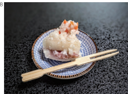
Kaburazushi (yellowtail sandwiched between turnips and marinated in malt)