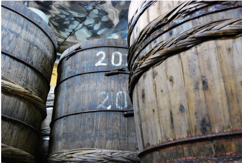
Miso brewery in Ono Port where wooden vats are used to make miso

September 21(Sat) - December 8(Sun) (scheduled)